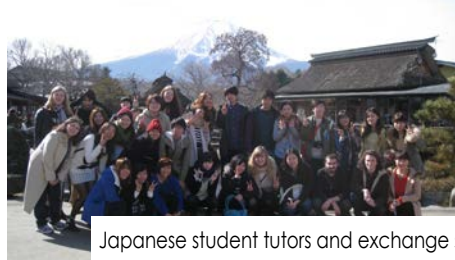
Japanese student tutors and exchange students on a joint excursion