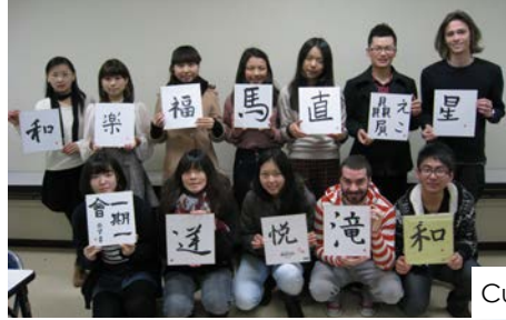
Culture Experience Class