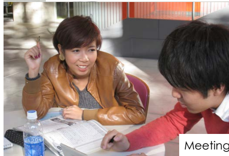
Meeting with a Japanese tutor